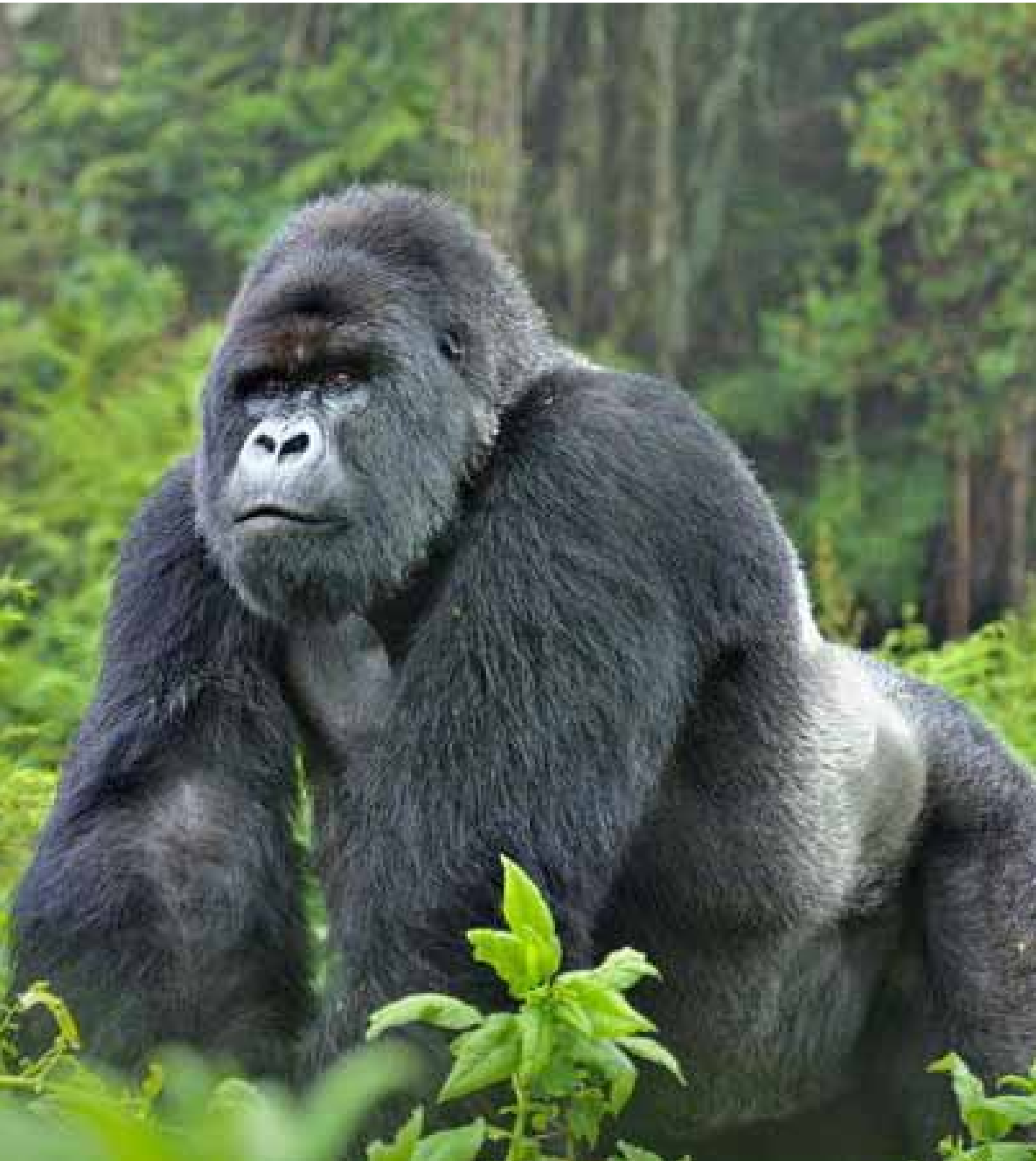
Silverback mountain gorilla.