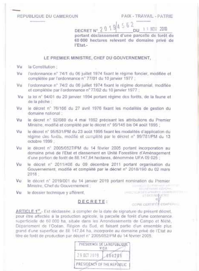
Decree degazetting 60 000 ha.

itself confirms this anomaly by stating in its non-technical summary that “the project site sits on the severely degraded part of FMU 09 025, which has been the subject of declassification in accordance with Decree No. 2019/4562 of 11 November 2019 on the declassification of a 60,000-ha forest plot in the private domain of the State”. Consequently, the failure to comply with these two substantive conditions could call into the legality of Decree No. 2019/4562. Even when the forest is declassified, it still has to be attributed for it to be qualified for exploitation.