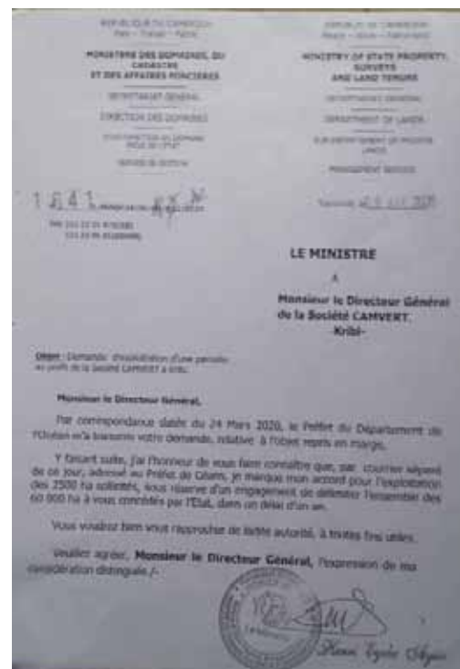
Letter from MINDCAF to Camvert.

unoccupied and unexploited lands of the national domain are attributed by way of provisional concession. Depending on the situation, this can be transformed into a lease or final concession. Thus, any natural or legal person wishing to develop unoccupied and unexploited land in the national domain must make a request (article 4) to the service of the state of the location of the building (article 6). Concessions of less than 50 ha are attributed by decree of the Minister in charge of domains and those of more than 50 ha, are attributed by Presidential Decree (article 7). Based on these legal precisions, what then is the case with the CAMVERT Project?