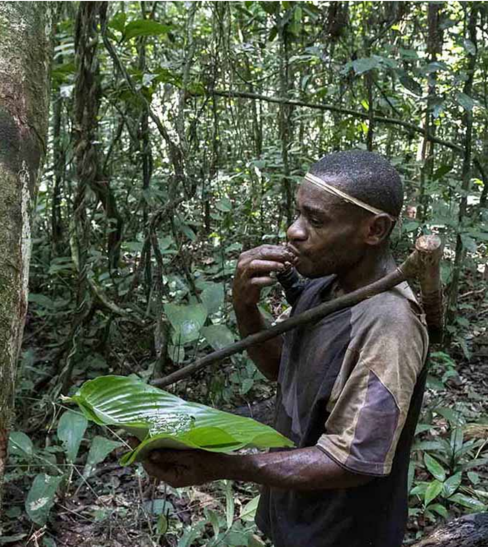
Uses of forests by indigenous forest people.